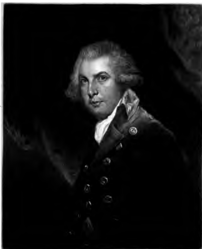
Portrait of John Jay